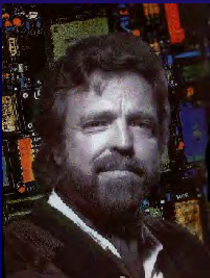
John Perry Barlow